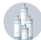
Arctic Pure Water Filters