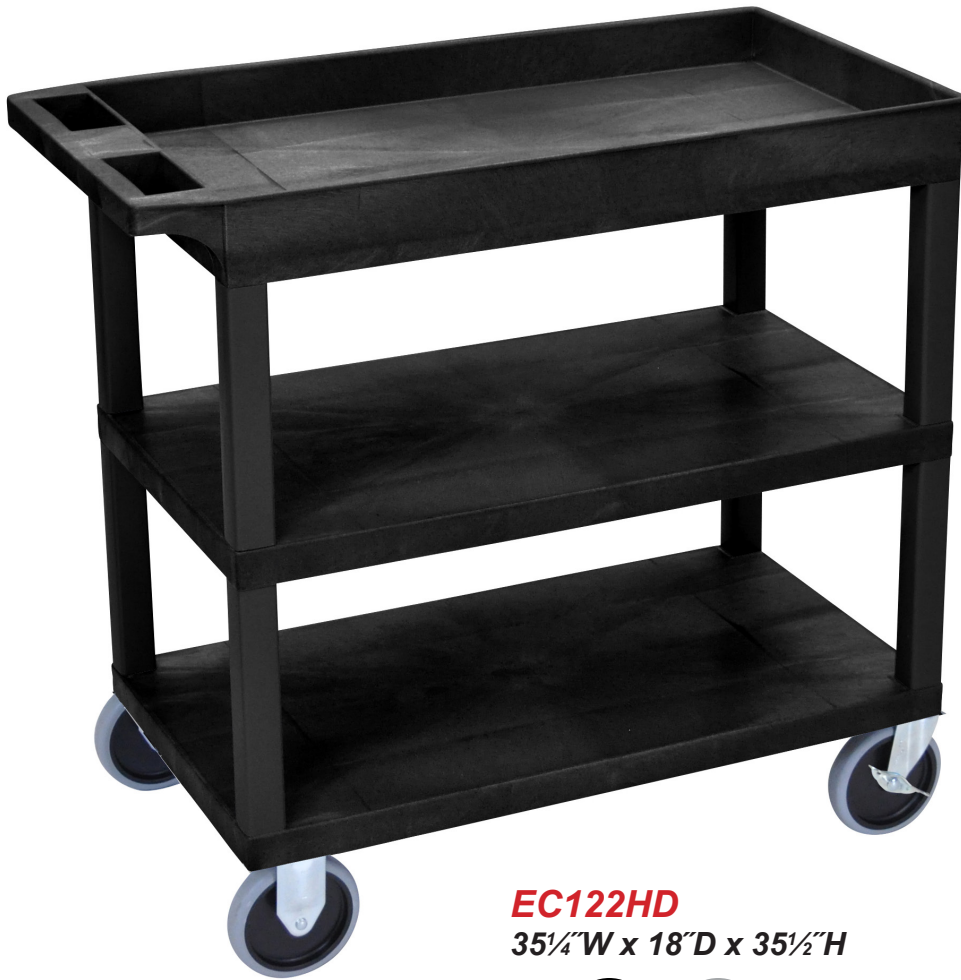
EC122HD 35¼"W x 18"D x 35½"H