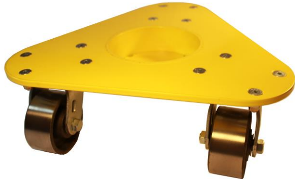
Model 4200 PH