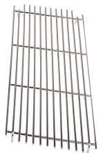
WIRE GRILL, DRIP TRAY (SINGLE)