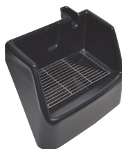
TRAY ASSY, EXTENDED DRIP