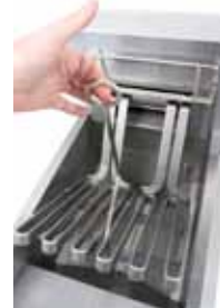
Combines swing-up elements with controlled burn-off cleaning (RE14 illustrated.). Lift handle not available on 22 kw split pot element assembly.

8700 Line Avenue Shreveport, LA 71106-6800 USA