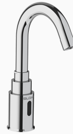
Variation not shown: 4" Trim Plate