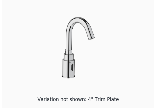
Variation not shown: 4" Trim Plate