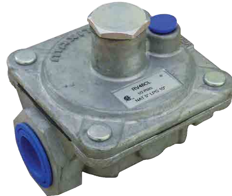
RV48CL-32_42 (1/2 PSIG Gas System)

Gas appliance regulators are designed for main burner and/or pilot applications, where precise control of tiny flows is an essential operating requirement. Housings are high strength aluminum castings and all models have been tested for multi-position and may be installed in any plane or angle without restriction. They may be used with natural, manufactured, mixed LP, or LP gas-air mixture.