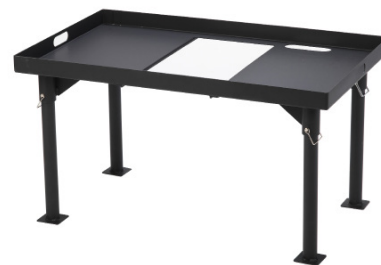
TB-36 Table Stand