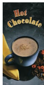
Model FMD-1 available with optional Hot Chocolate Display