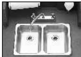
2-Compartment Stainless Steel Sink