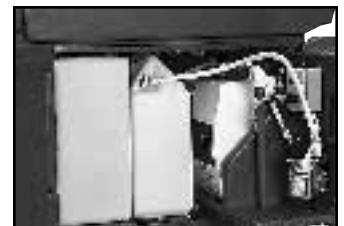
Tanks and Hot Water Heater