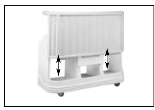
Detachable front for easy access to inventory and routing lines, tubes and hoses.