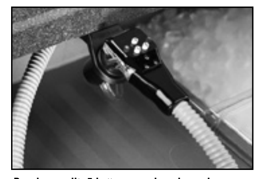
Premium quality 5-button, pre-mix soda gun by Wunder-Bar®. (shown on Cambar650DS model)