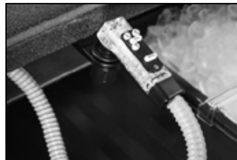
Premium quality 5-button, post-mix soda gun by Wunder-Bar® with fast, low foaming delivery. (shown on Cambar650DS model)