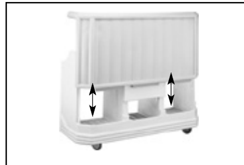
Detachable front for easy access to inventory and routing lines, tubes and hoses.