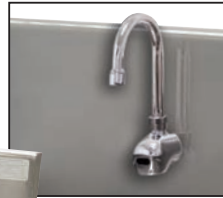
Hands-Free Electronic Faucet