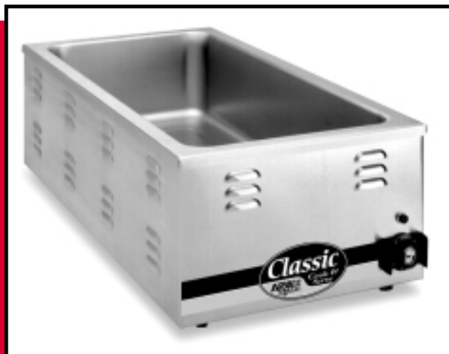
MODEL CW-3A COUNTERTOP COOKER