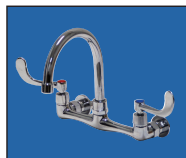
"-F" Series Sink Includes K-161-LU Gooseneck Faucets with Wrist Handles