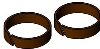
(2) Heat Resistant Swivel Sleeves