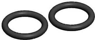
(2) Heat Resistant O-Rings