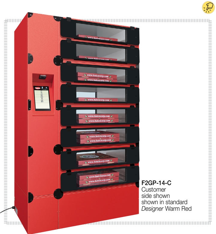
F2GP-14-C Customer side shown shown in standard Designer Warm Red

NOTE: This unit is intended for stationary indoor, commercial use only—NOT for mobile applications.