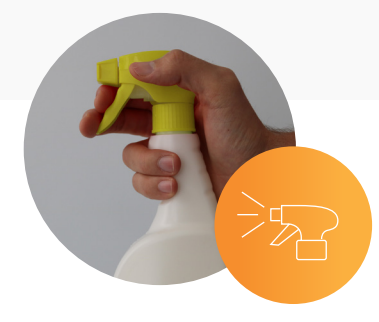
3. Apply a antibacterial cleaner suggested by Zumex and leave to rest for 1 minute.

1. Apply Zumex Citric Active™ to remove wax and pulp. Leave to act 30 seconds and remove the dirt with a sponge.