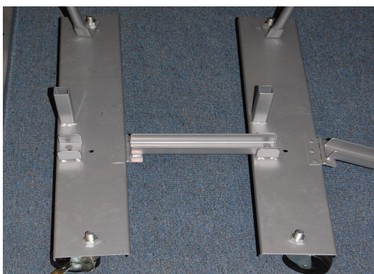
Step #3 Connect the two caster bases with the unit to unit locks as shown.(lock caster brakes)