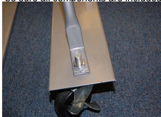
Step #2: Install 2 nd caster to the other end of the caster base and add the supports strut as shown. Repeat for all caster bases.