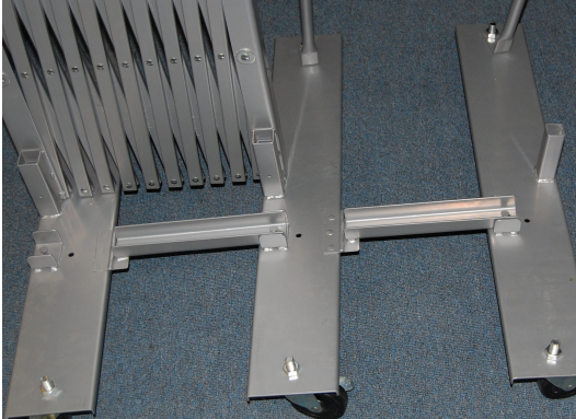
Step #5: Add the last caster base as shown.