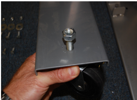
Step #1: Install caster to the end of the caster base closest to the unit to unit lock