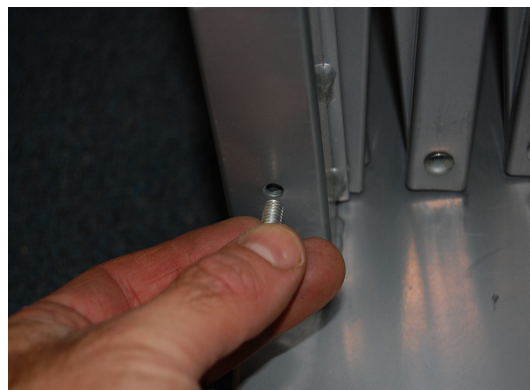
Step #10: Add set screws to the bottom of each section to hold in place..