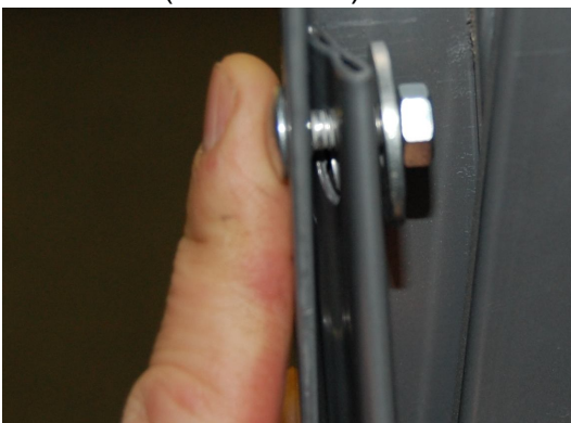
Step #9: Attach the strut to the end section of the expanding gate..