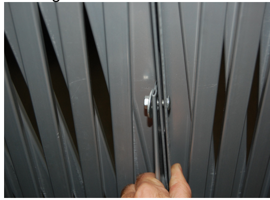
Step #8: Attach the center strut and add bolts to the top and bottom of the gate sections.