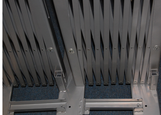
Step #6: Add the second expanding gate section as shown.