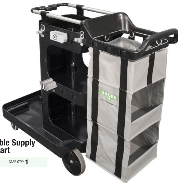
Unger Double Supply Cleaning Cart

Purchase an empty cart and add the right tools for your cleaning needs