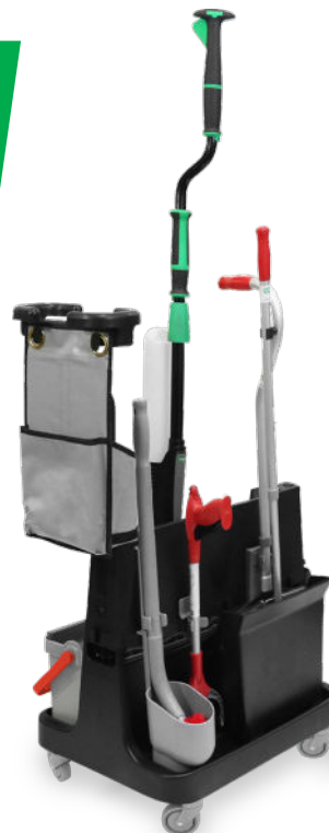
Unger OmniClean Restroom Cart