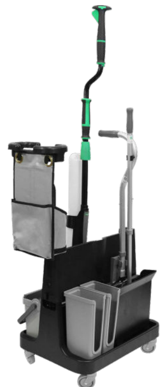
Unger OmniClean Spot Cart