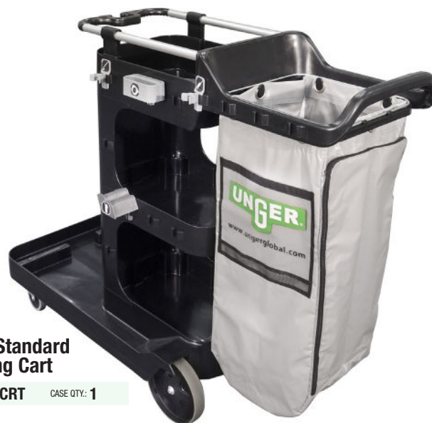
Unger Standard Cleaning Cart