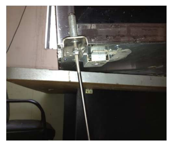
5.Remove door bushing from righttop side of door.

3. Screw the screws located on left of bottom hinge.