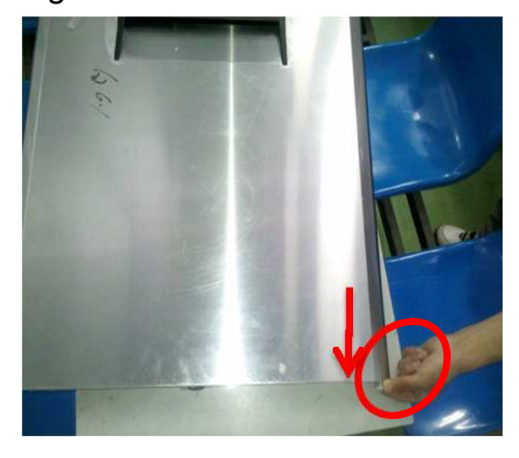
6.Pull out spring bar from the right side of door.

4. Take apart door dushing from the right bottom side of door .