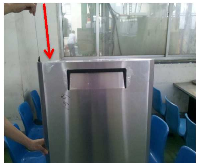
11.Install the door bushing (5mm) in the left bottom side of