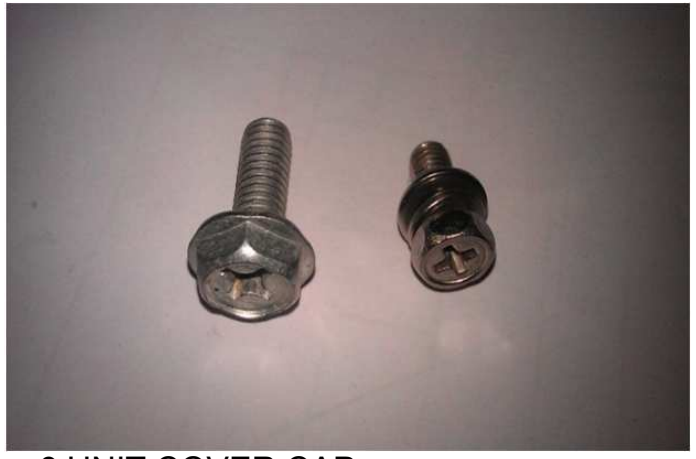
6.UNIT COVER CAP