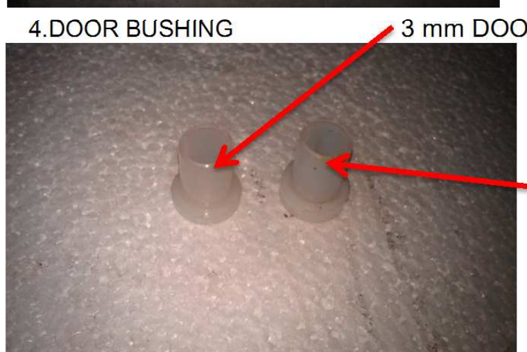
◆ 3 mm DOOR BUSHING