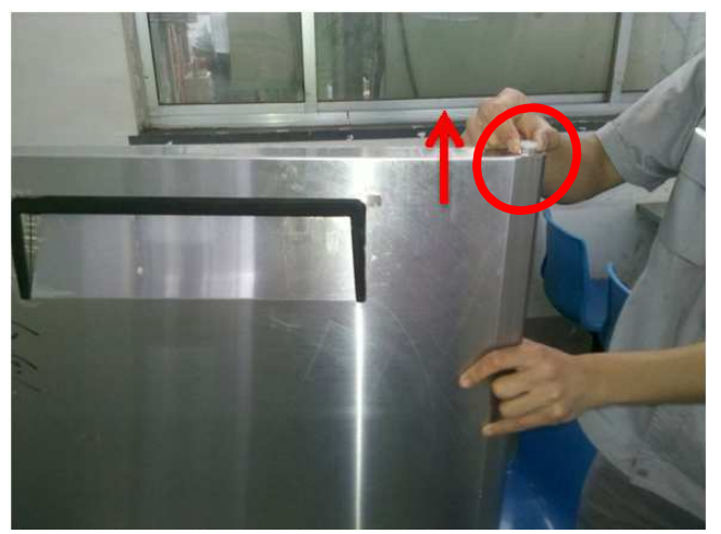
7. Take apart unit cover cap from the left-top side of door.