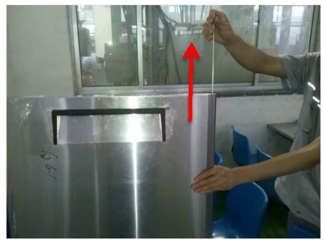
8. Take off unit cover cap from the left-top side of door, then install it in the right side of door hole.