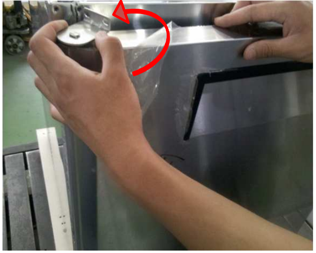
14.Follow the arrow while you open the door.