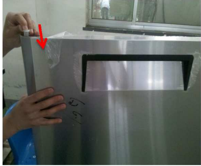
1∠.Aπer installing the door,screw the top hinge(follow the arrow.)