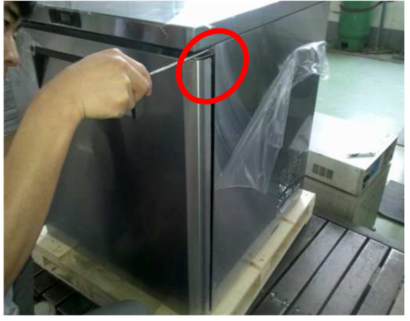
3.Lift the door, then remove it.