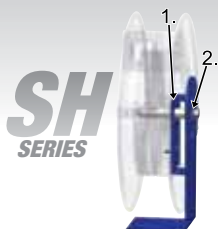
Double axle support on SH, MP & HP Series

SUPER HUB™ EQUIPPED MODELS: INCREASED REEL STRENGTH for more demanding applications with multiple support to the axle