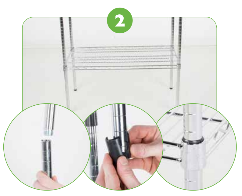
Assemble all shelves. Check that top of the top shelf and the top of the bottom shelf are 52 1/2 " apart for panels to latch on.