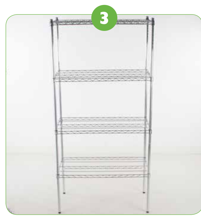
Attach the two back and two side panels to shelves. Be sure that panel hooks go through the shelves.