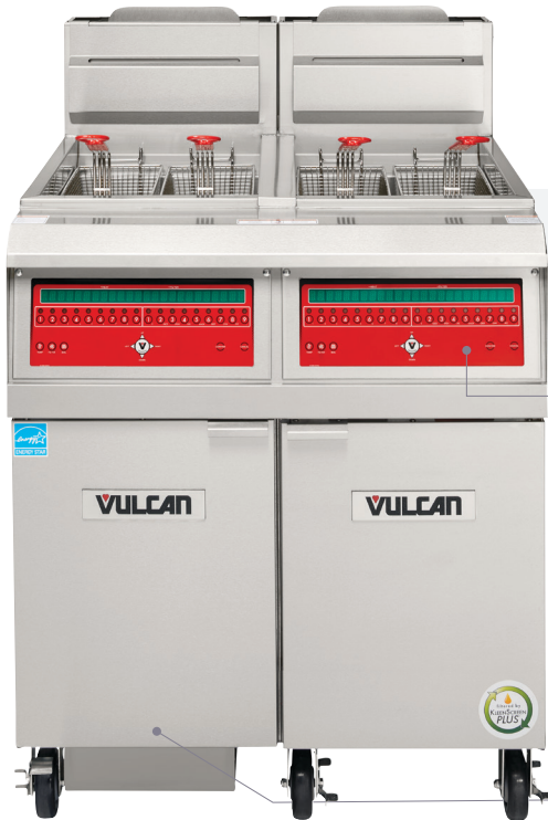
2VHG50CF - Solid State Computer Controls with KleenScreen PLUS® filtration