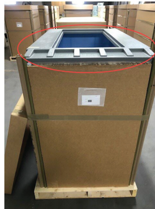
IMPORTANT DO NOT DISCARD POLYCARBONATE BIN ADAPTER

Please provide the model number and serial number of the bin.