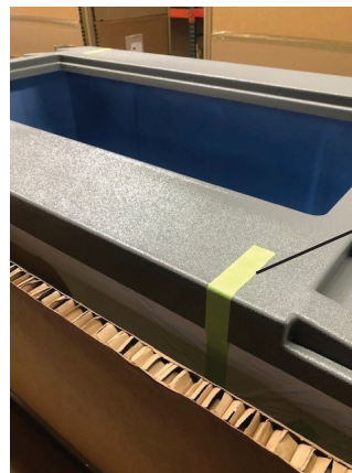
POLYCARBONATE BIN ADAPTER WILL BE TAPED INTO PLACE