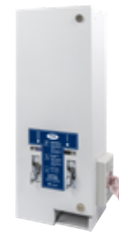
Dual Channel Vendors