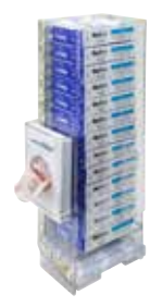
Comfort Plus® Courtesy Dispenser