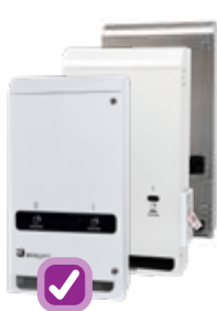
Evogen® EVNT3 No-Touch Vendor