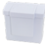
Plastic Receptacle (Removable Rigid Plastic Liner)