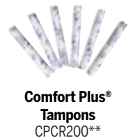
Comfort Plus® Tampons CPC200**