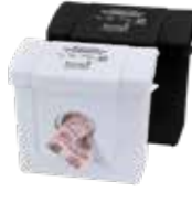
Scensibles® Plastic Combination Receptacle (Removable Rigid Plastic Liner)