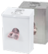
Scensibles® Metal Combination Receptacle