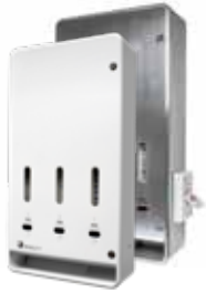
Evogen® EVNT6 Tri-Vend High Capacity No-Touch Vendor