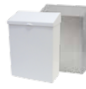
Metal Receptacle (Hinged Bottom)