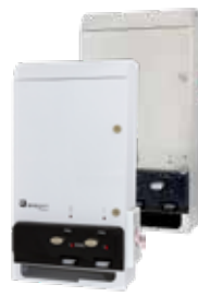
Evogen® EV1 Vendor