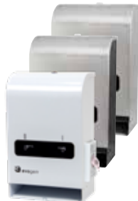
Evogen® EVNT4 No-Touch Vendor