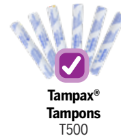
Tampax® Tampons T500