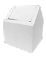
Swing Type Double Entry Metal Receptacle