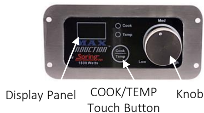
Figure 2. Induction Range Control Box