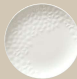
6 3/8" Coupe Plate No. 988001 018 H5/8 3 doz./26# • .9 cu. ft. Partially faceted surface