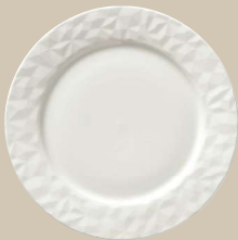
9" Plate No. 988001 139 H¾ 2 doz./21# • .62 cu. ft. Faceted rim