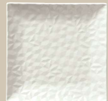
8 1/2" Square Plate No. 988001 136 H1 1/2 2 doz./29# • .66 cu. ft. Full faceted surface