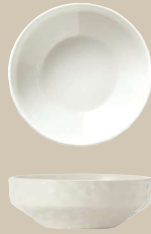
20 oz. Cereal Bowl No. 988001 760 H2¼ F3¼ D6 3 doz./24# • .8 cu. ft.