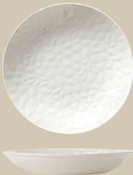
55 oz. Deep Coupe Plate No. 988001 785 H1 3/4 D11 1 doz./20# • 1.04 cu. ft. Full faceted surface