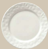
6½" Plate No. 988001 118 H¾ 3 doz./26# • 1.0 cu. ft. Faceted rim