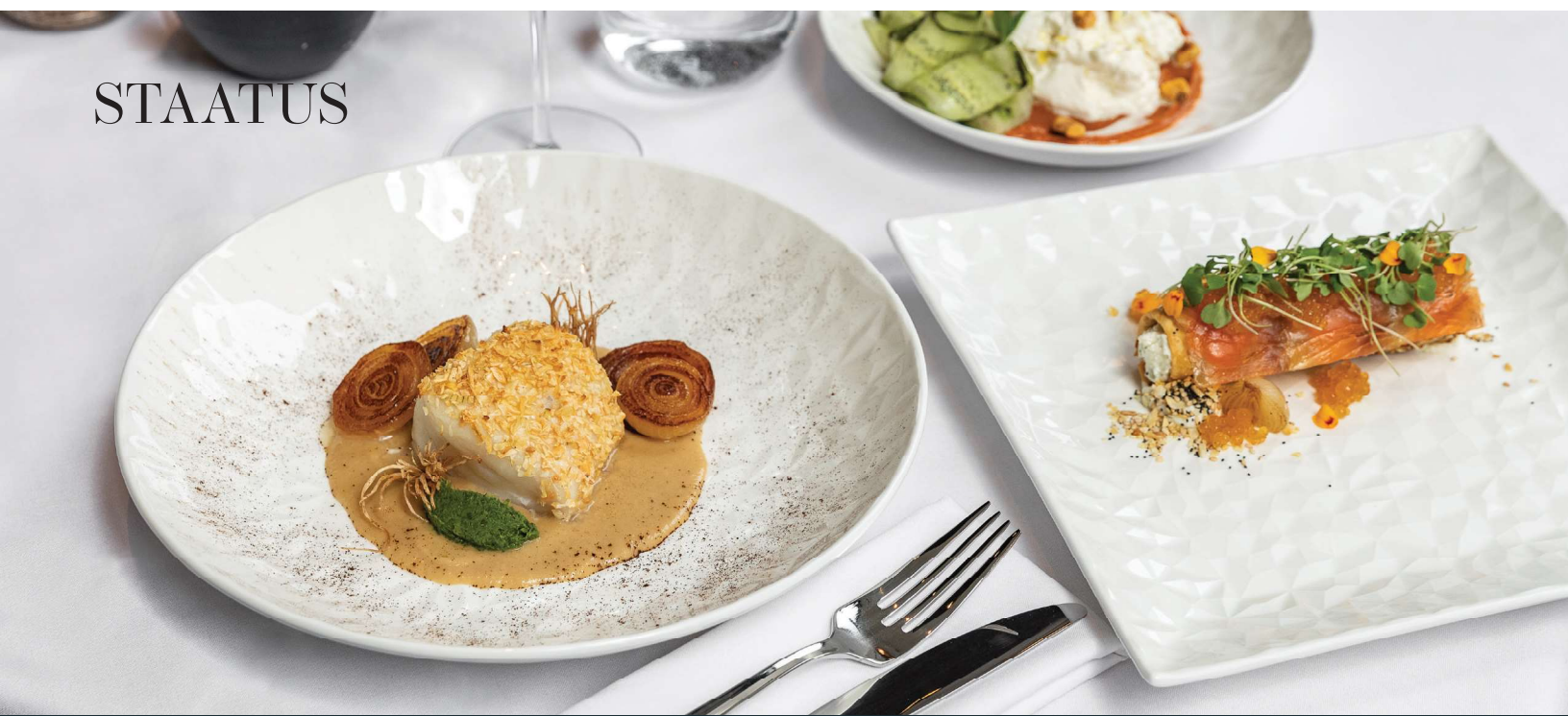
Shown: Status dinnerware