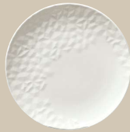
8 1/2" Coupe Plate No. 988001 036 H7/8 2 doz./20# • .61 cu. ft. Partially faceted surface