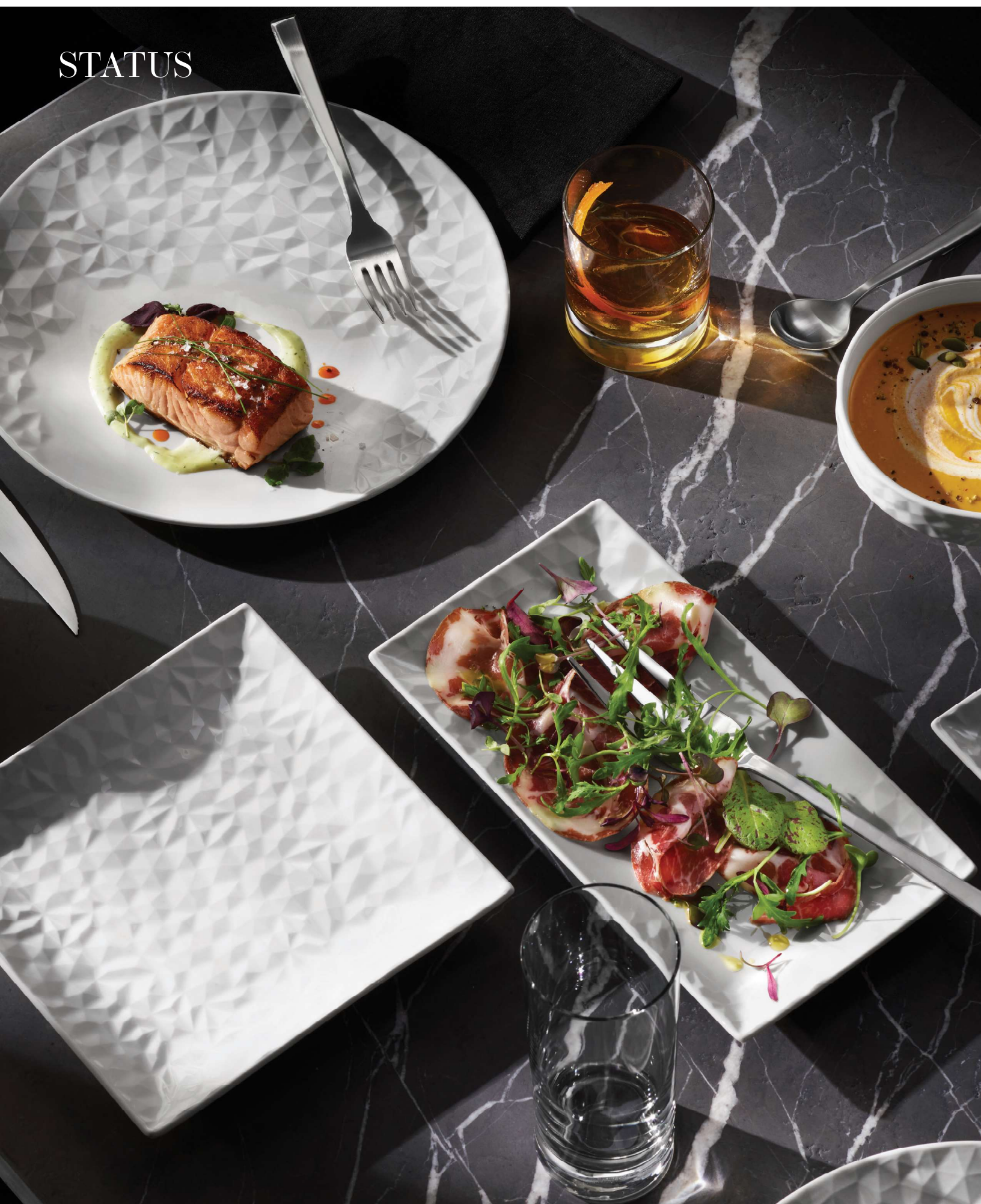
Shown: Status dinnerware, Santorini flatware and Modernist glassware