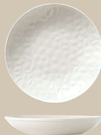
25 oz. Deep Coupe Plate No. 988001 774 H1 1/4 D8 2 doz./22# • .83 cu. ft. Full faceted surface