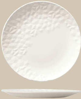
11" Coupe Plate No. 988001 055 H1 1/8 1 doz./20# • .81 cu. ft. Partially Faceted Surface

An aesthetically and tactilely intriguing faceted surface gives Status dinnerware a modern, sophisticated vibe unlike any other, available in Libbey's premium Royal Rideau body color. A wide assortment of modern and traditional shapes provides a rich variety of presentation options – extensive versatility ideal for hospitality venues looking to create a unified look throughout the property.