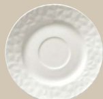
6" Saucer No. 988001 500 H¼ D6 WL2 3 doz./22# • .88 cu. ft. Faceted rim