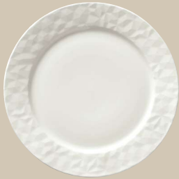
10½" Plate No. 988001 151 H¾ 1 doz./18# • .67 cu. ft. Faceted rim

Geometric, faceted surface creates a fresh, chic aesthetic, elevating the intrigue and personality of white dinnerware.