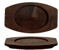
7" Wood Trivet-Cass, Oval No. CIS-27TR H½ L7¾ W4¾ 1 doz./3# • .3 cu. ft.