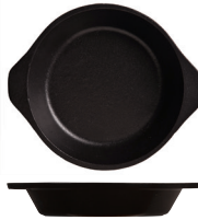
7½" x 6½" Pie Plate w/Handles No. CIS-17 H1¼ 1 doz./25# • .7 cu. ft.