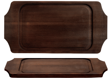
14" Wood Trivet, Rectangle No. CIS-19TR H½ L14¾ W7¼ 6 pcs./4# • .4 cu. ft.