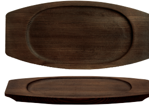
12¼" Wood Trivet, Oval No. CIS-18TR H½ L12¼ W5¼ 1 doz./7# • .5 cu. ft.