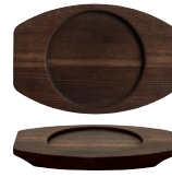
6" Wood Trivet-Cass, Round No. CIS-25TR H½ L6¼ W4¾ 1 doz./3# • .2 cu. ft.