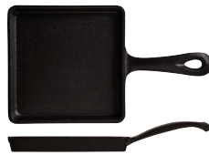
5½" Square Skillet w/Handle No. CIS-16 H1¼ 1 doz./27# • .7 cu. ft.