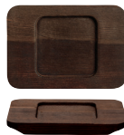
5½" Wood Trivet-Cass, Square No. CIS-26TR H½ L5½ W4 1 doz./3# • .2 cu. ft.