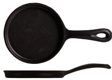
5" Round Skillet w/Handle No. CIS-15 H1½ 1 doz./19# • .5 cu. ft.