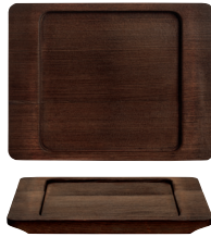
7" Wood Trivet, Square No. CIS-16TR H½ L7¾ W6¾ 1 doz./6# • .4 cu. ft.