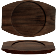
7" Wood Trivet, Round No. CIS-15TR H½ L7¾ W7 1 doz./6# • .3 cu. ft.