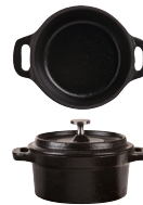
9 oz. Miniature Dutch Oven w/Lid, Round No. CIS-25 H3 F3¾ L5¼ W4 1 doz./29# • .5 cu. ft.