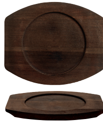
8½" Wood Trivet, Round No. CIS-17TR H½ L8¾ W7 6 pcs./3# • .3 cu. ft.