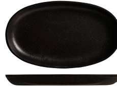
9" x 5½" Oval Tray No. CIS-18 H¾ 1 doz./30# • .5 cu. ft.