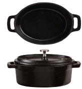
11 oz. Miniature Dutch Oven w/Lid, Oval No. CIS-27 H3 F2½ x F3¾ L6¼ W3¾ 1 doz./28# • .5 cu. ft.