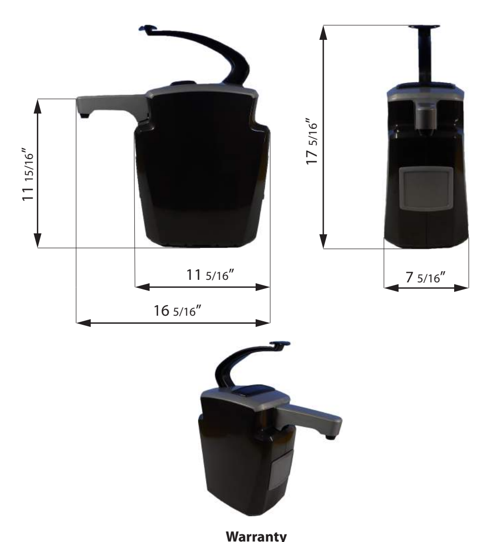
Heinz Keystone Dispenser is backed by a twelve month limited warranty against defects in materials and workmanship