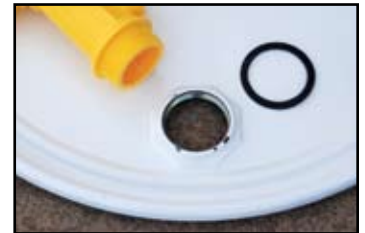
TITEGRIP™ Gasket #3