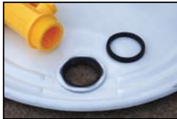
VERSEGRIP® Gasket #1

The choice of which gasket to use on the faucet is dependent on the drum opening in use. There are three (3) closure systems as shown below: