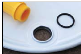
VGII™ Gasket #2