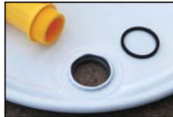
VGII™ Gasket #2