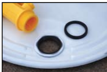
VERSEGRIP® Gasket #1

The choice of which gasket to use on the faucet is dependent on the drum opening in use. There are three (3) closure systems as shown below: