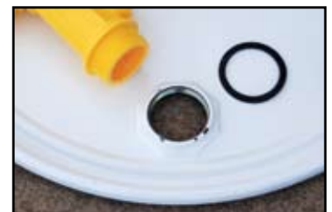
TITEGRIP™ Gasket #3