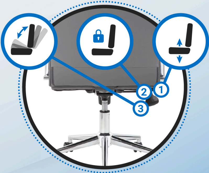
Pneumatic gas lift height adjustment, upright locking position, and spring tilt