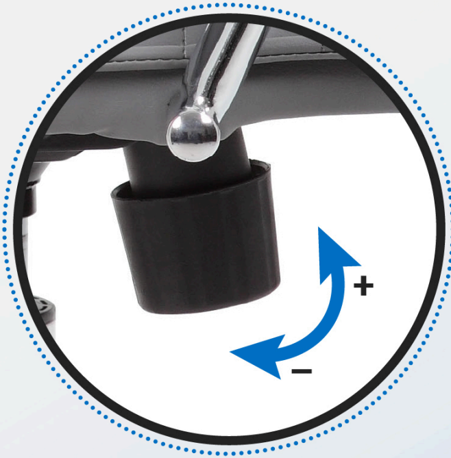
Tilt tension knob