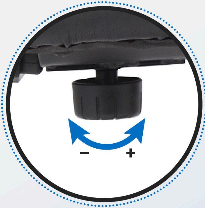
Back adjustment knob