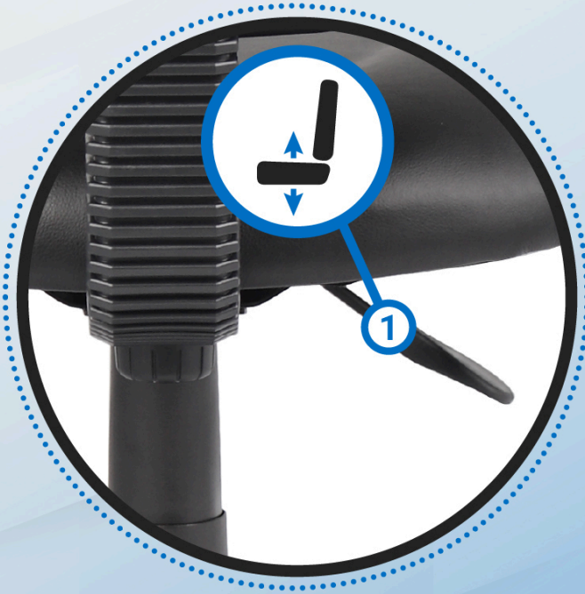
Pneumatic gas lift height adjustment