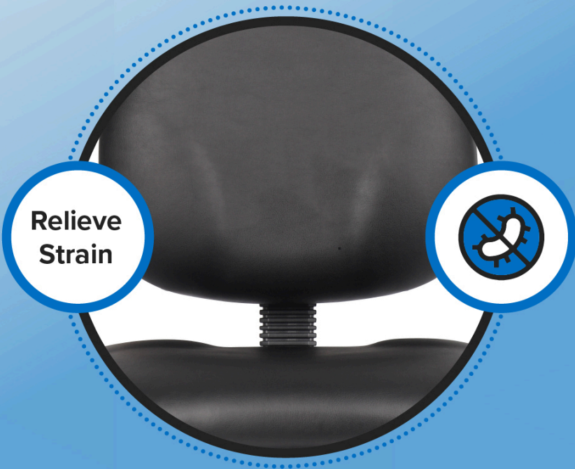
Contoured antimicrobial vinyl