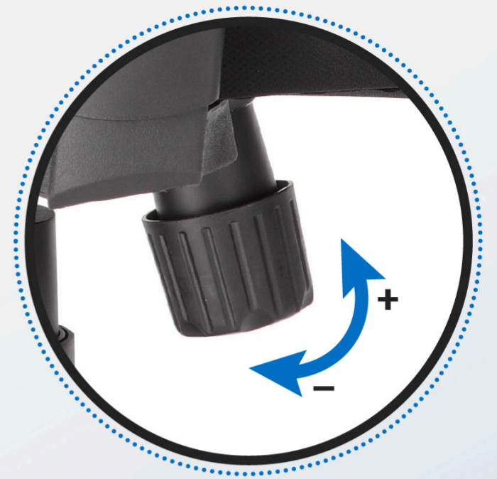
Tilt tension knob