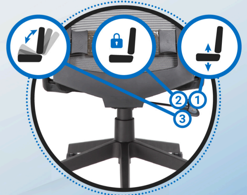
Pneumatic gas lift height adjustment, upright locking position, and synchro-tilt mechanism