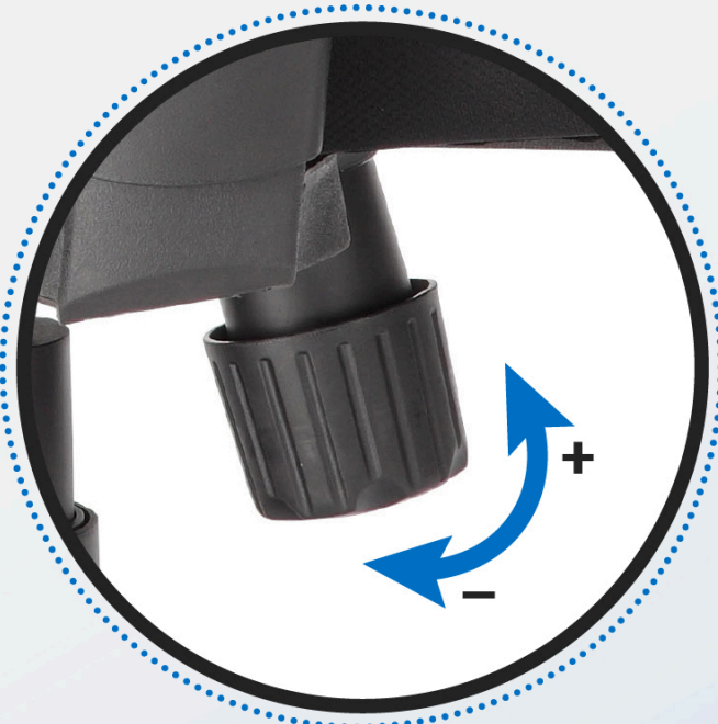
Tilt tension knob