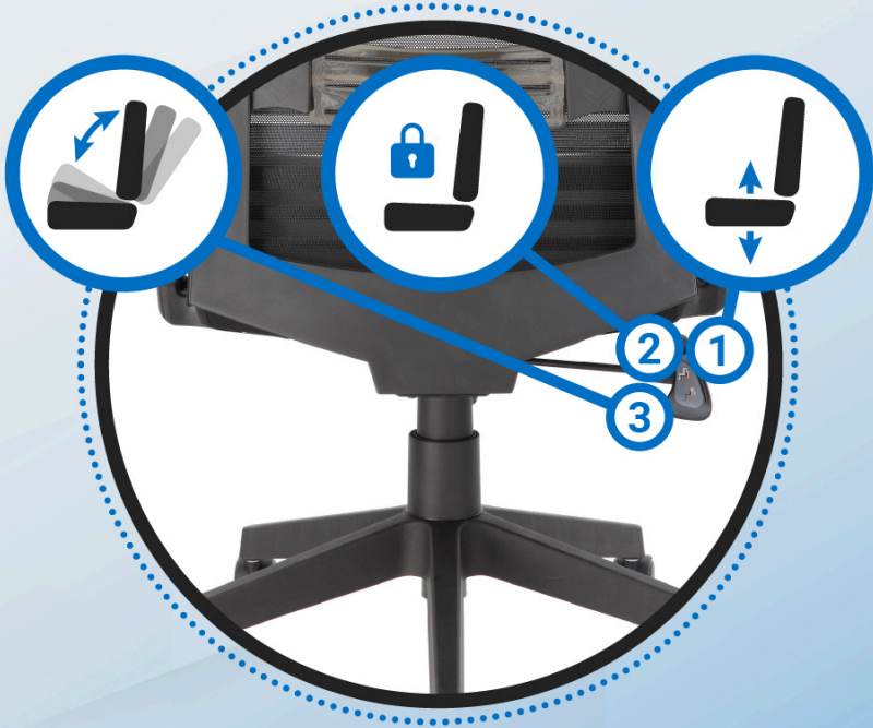
Pneumatic gas lift height adjustment, upright locking position, and synchro-tilt mechanism