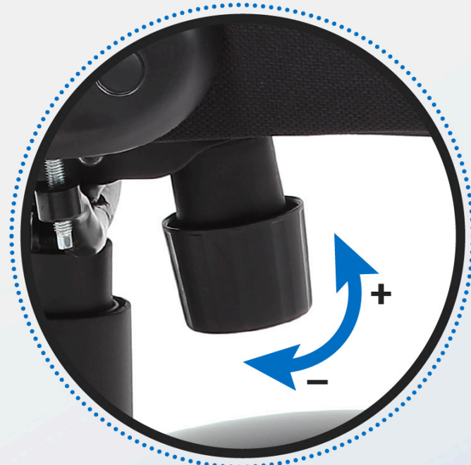
Tilt tension knob