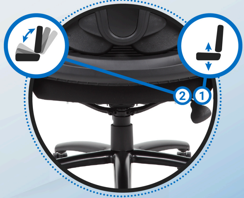
Pneumatic gas lift height adjustment and spring tilt