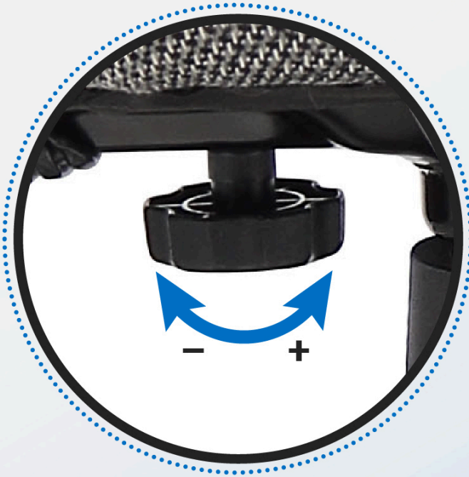
Back adjustment knob