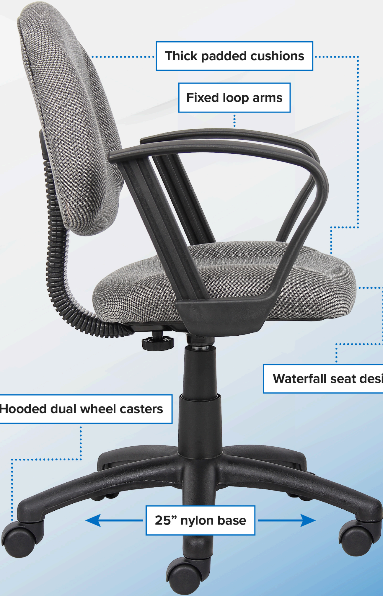
Thick padded cushions