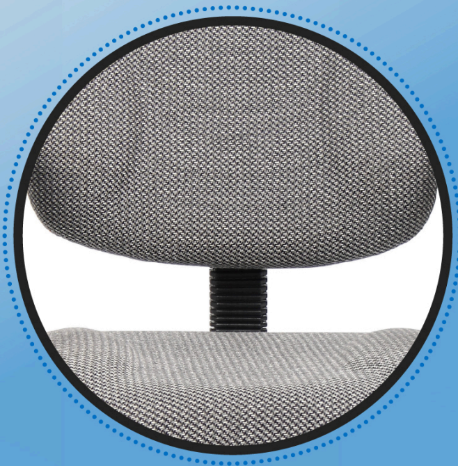
Tweed fabric upholstery