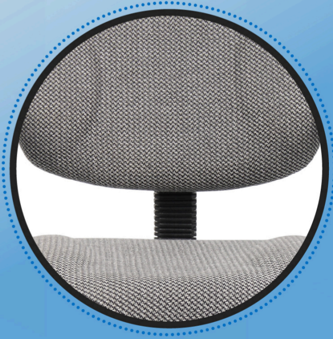
Tweed fabric upholstery