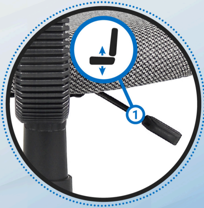
Pneumatic gas lift height adjustment