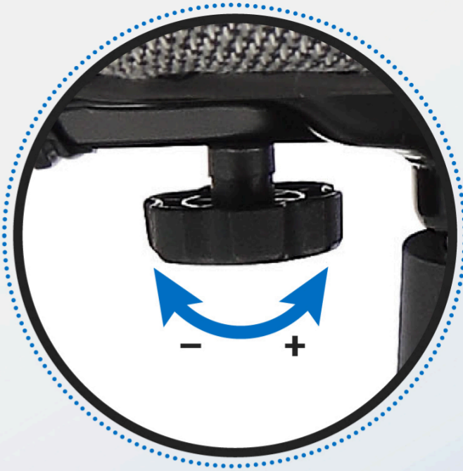
Back adjustment knob