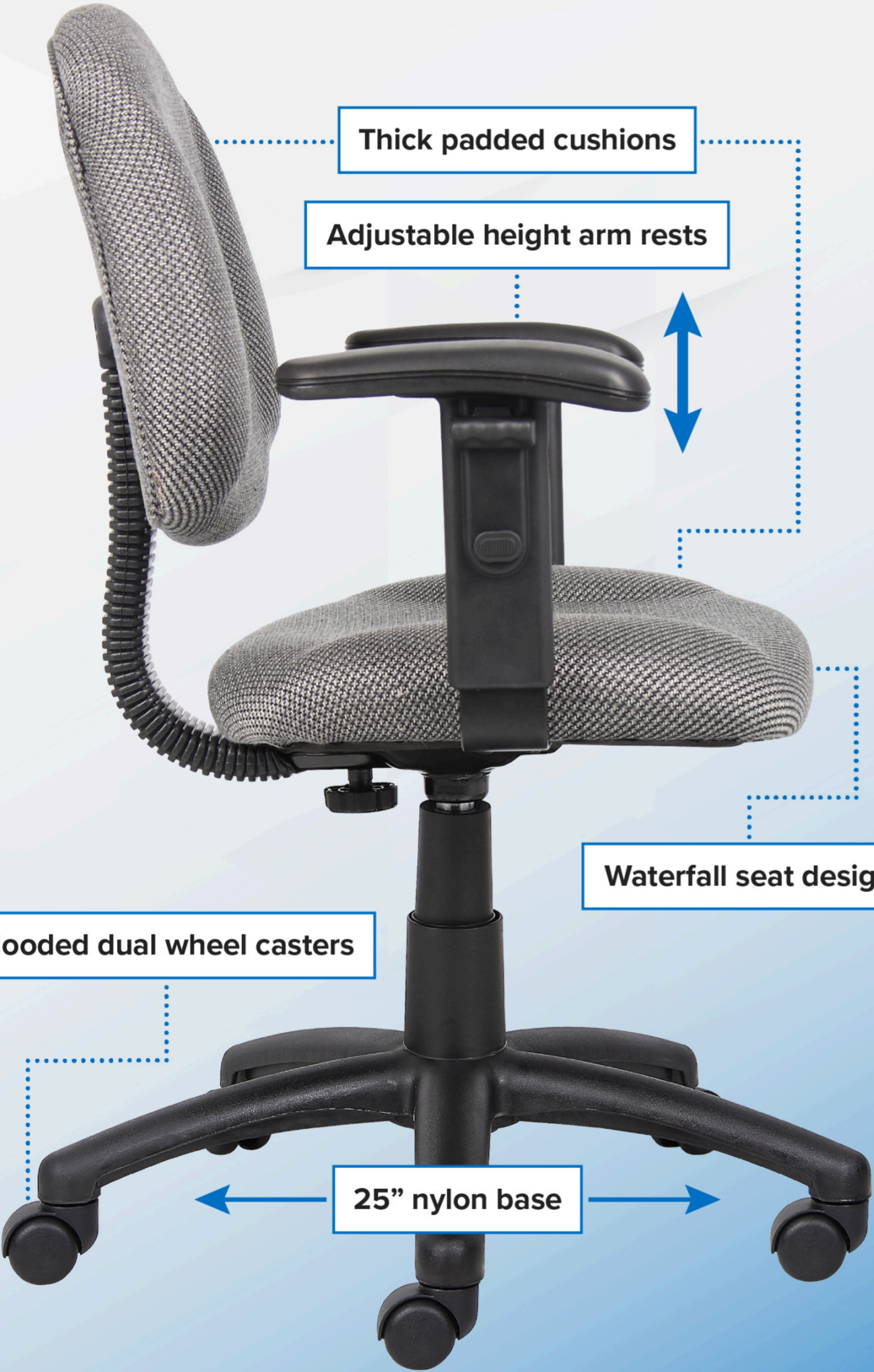
Thick padded cushions