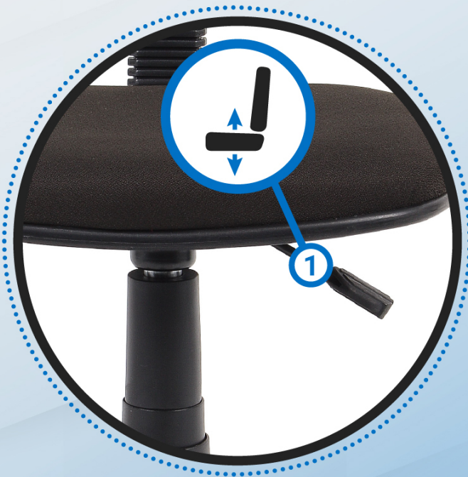
Pneumatic gas lift height adjustment