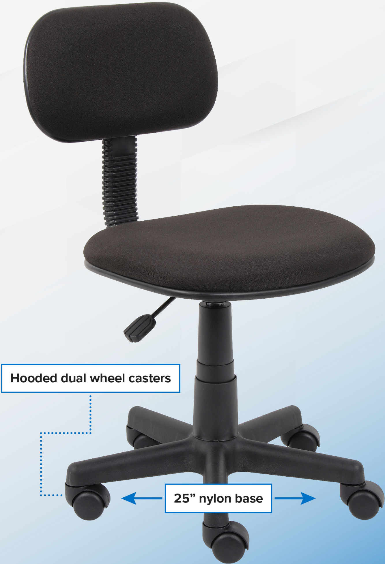
Hooded dual wheel casters