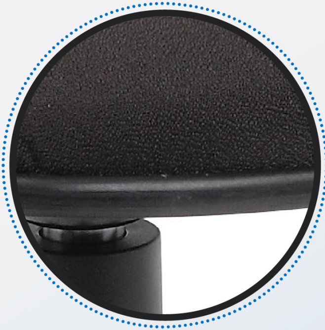
Durable plastic back & seat protection