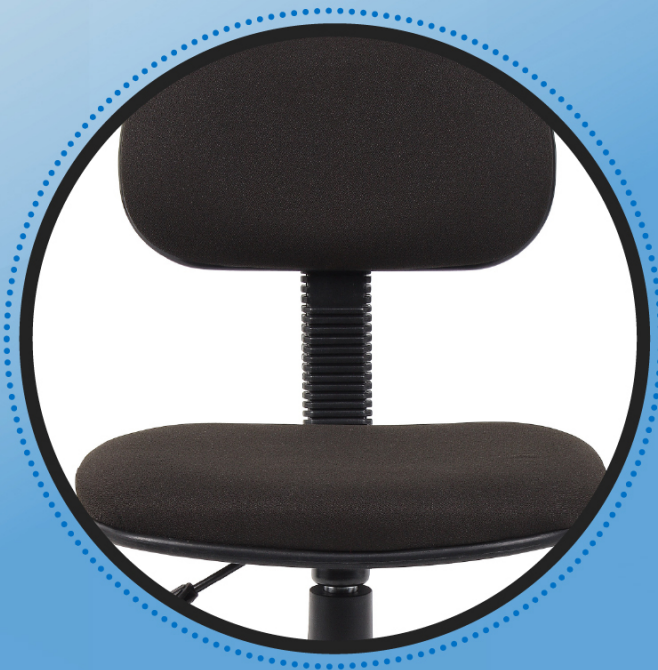
Crepe fabric upholstery