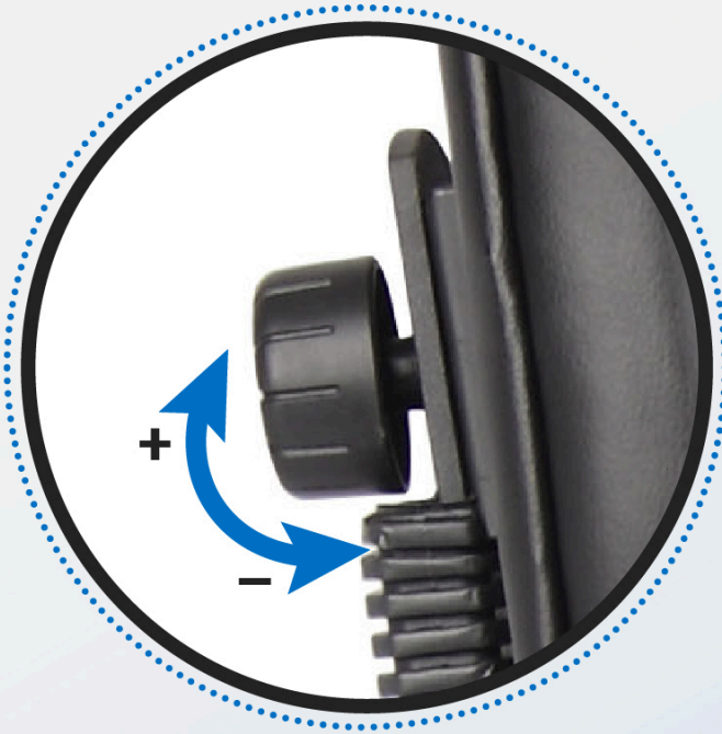
Back tilt adjustment knob