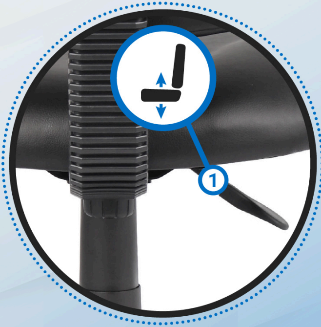
Pneumatic gas lift height adjustment