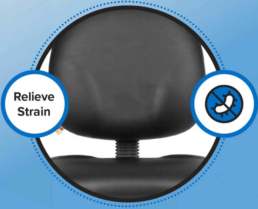
Contoured antimicrobial vinyl