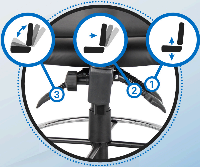
Pneumatic gas lift height adjustment, any position lock, and spring tilt mechanism