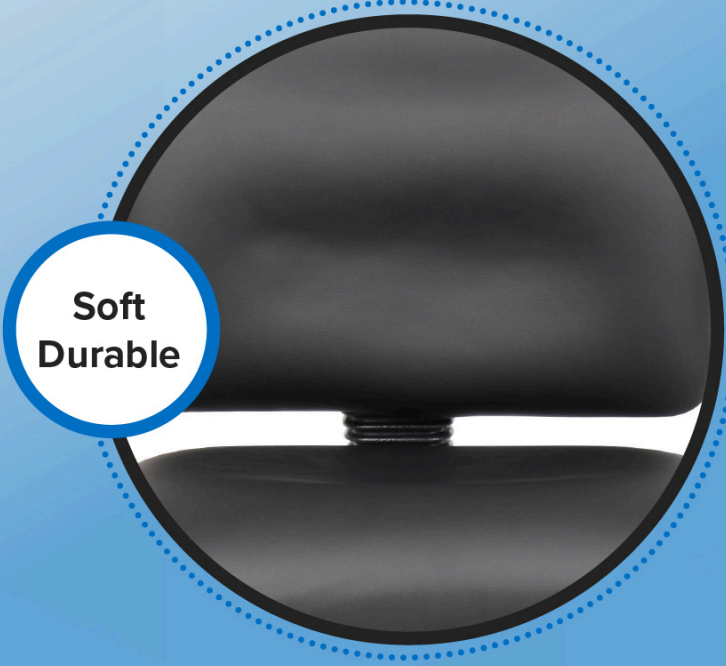
Black LeatherPlus upholstery