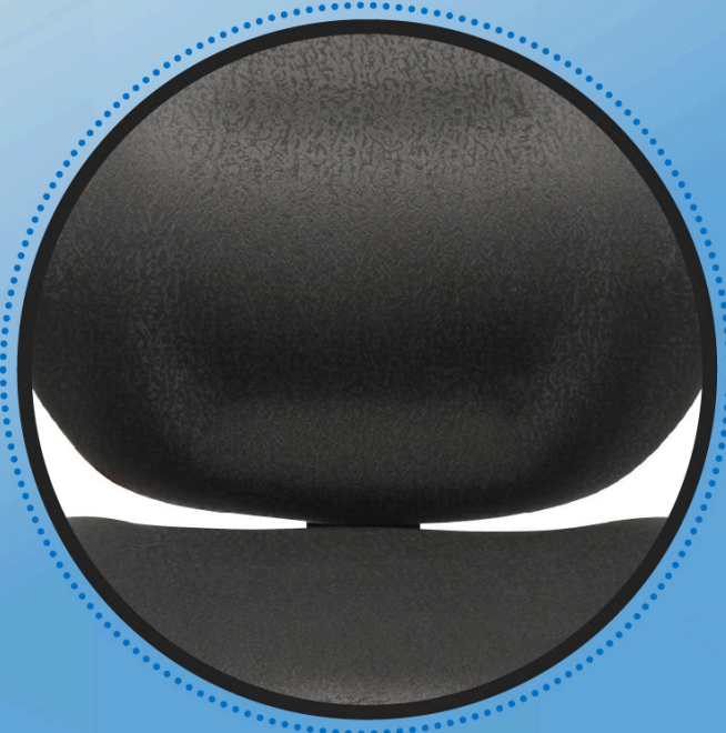
Commercial grade fabric upholstery