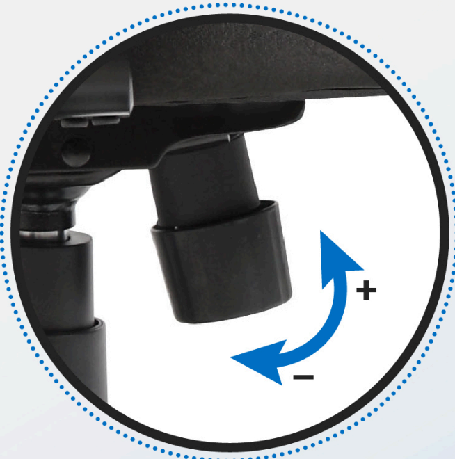
Tilt tension knob