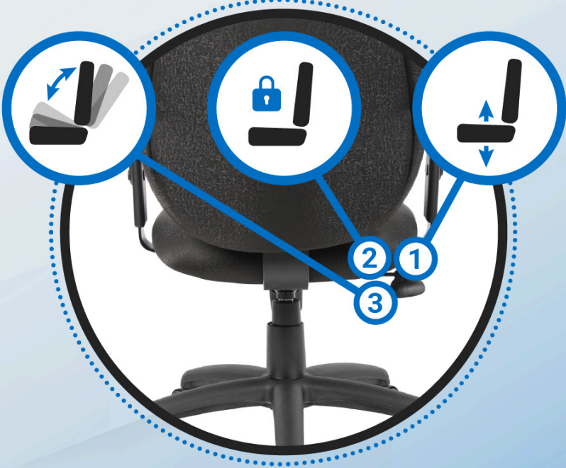
Pneumatic gas lift height adjustment, upright locking position, and spring tilt mechanism