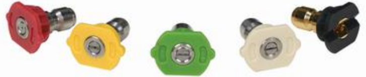
Four stainless steel nozzles tips 0°, 15°, 25°, 40°, and a brass soap nozzle all of which are corrosion resistant and provide a variety of spray patterns