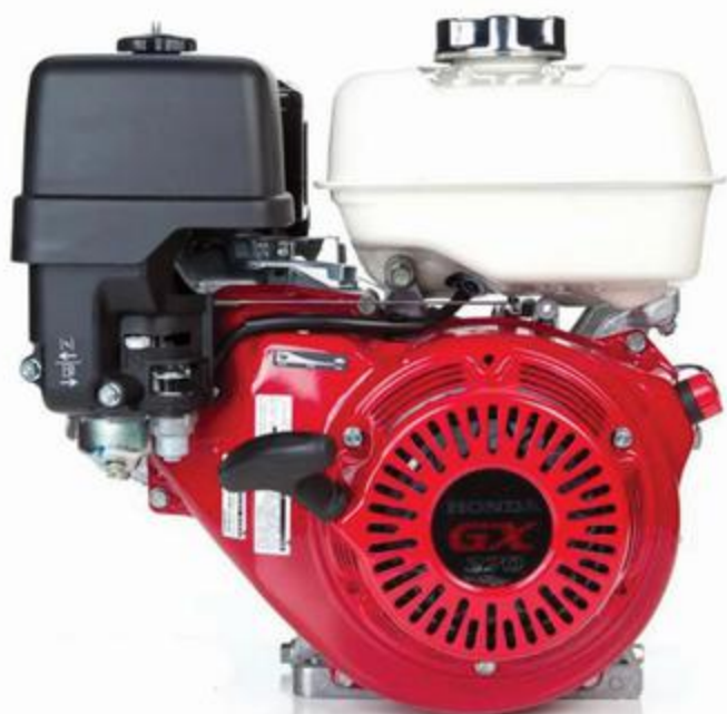
HONDA® GX270 Engine with low oil shutdown feature