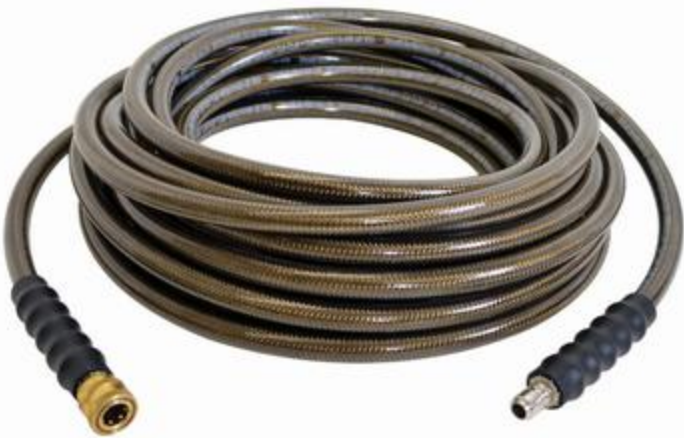
Is kink and abrasion resistant hose with quick connect fittings and polyurethane outer jacket