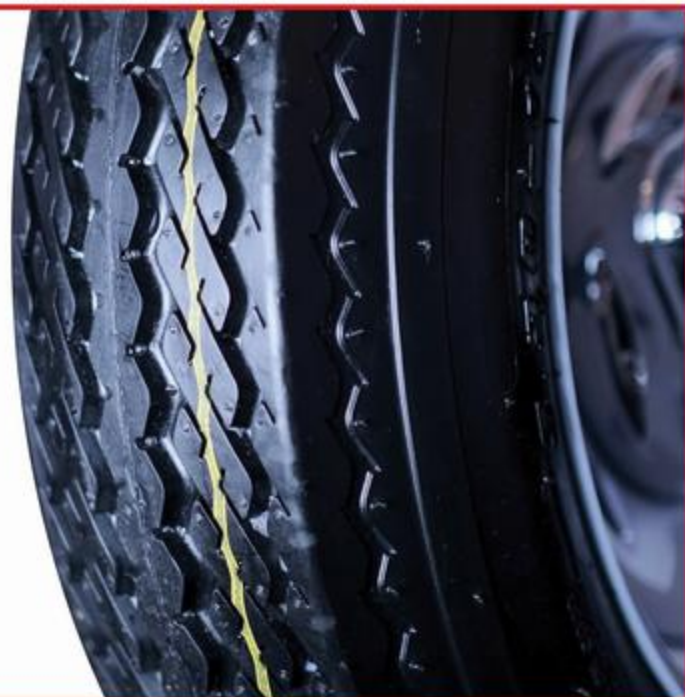
12 in. Premium 6-ply tires for ease of maneuverability across rugged terrain