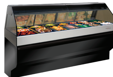
ED3-96 Stationary Base