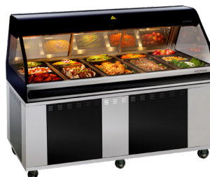
ED3-72 Mobile Base