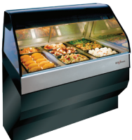
ED3-48 Stationary Base