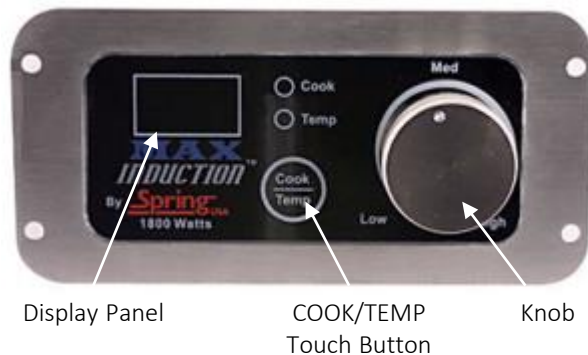
Figure 2. Induction Range Control Box