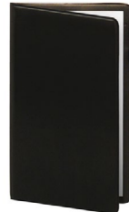
WAIT PAD HOLDER