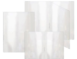
ALL CLEAR VINYL