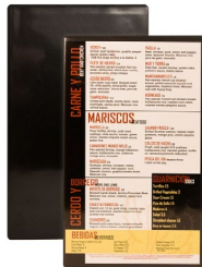
TUSCAN MENU BOARD