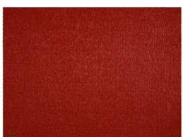
GA VINYL WOVEN PLACEMATS