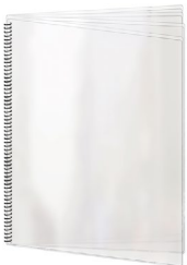
ALL CLEAR SPIRAL