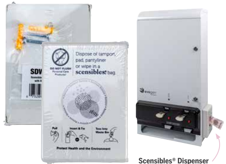
Scensibles® Dispenser and Refill Pack

Lightly scented, Scensibles® disposal bags have easy tie handles to safely dispose of used menstrual care products and feature a built-in antimicrobial additive that inhibits the growth of odor-causing bacteria on the bag, helping to keep restrooms smelling fresh. Refillable and compact, the bag dispensers are imprinted with instructions for use, making it clear not to flush products down the toilet.