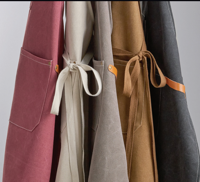
Wine, Cream, Pebble, Mocha and Black Colors