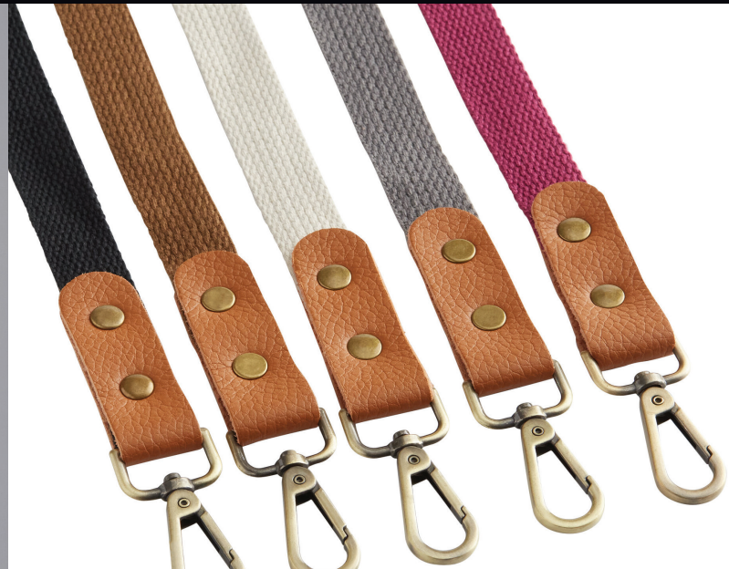
Extra Long 66" Straps for Maximum Adjustability