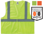
8205HL/8205Z VEST, MESH, TYPE R, HOOP & LOOP OR ZIPPER, NO POCKETS