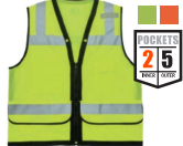
8253H0Z VEST, HEAVY-DUTY MESH SURVEYORS, TYPE R, ZIPPER