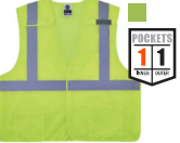
8256Z VEST, SELF-EXTINGUISHING, TYPE R, ZIPPER