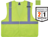
8217BA VEST, BREAKAWAY, MESH, TYPE R