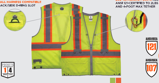
8231TV VEST, TOOL TETHERING, TYPE R, ZIPPER, DUAL COMPLIANT: ANSI/ISEA 121 AND ANSI/ISEA 107 CERTIFIED FOR DROPPED OBJECT PREVENTION AND HI-VIS COMPLIANCE

When you're burning the midnight oil on interstate highways and byways, spelunking below the crust of the earth ferreting out the next great mother lode or fixing your burgh's energy grid during a blackout, you need to make sure you're visible. Highly visible. To avoid drama in the darkness, outfit yourself in our ANSI-compliant GloWear safety vest line and become a beacon unto others.