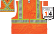
8235ZX VEST, TWO-TONE, X-BACK, TYPE R, ZIPPER