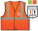
8216BA VEST, BREAKAWAY, MESH, TYPE R, ID BADGE HOLDER