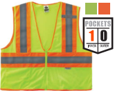
8230Z VEST, TWO-TONE, MESH, TYPE R, ZIPPER