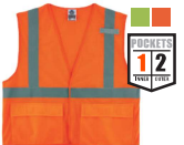
8220HL/8220Z VEST, MESH, TYPE R, HOOK & LOOP OR ZIPPER, STANDARD