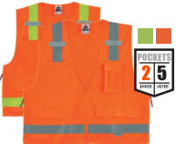
8250Z/8250ZH6 VEST, SURVEYORS, TYPE R, ZIPPER / COMBINED PERFORMANCE TAPE