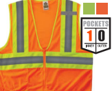
8229Z VEST, TWO-TONE, TYPE R, ZIPPER, ECONOMY