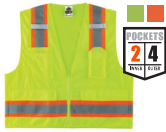
8248Z VEST, TWO-TONE SURVEYORS, TYPE R, ZIPPER