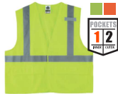
8225HL/8225Z VEST, SOLID, TYPE R, HOOK & LOOP OR ZIPPER, STANDARD